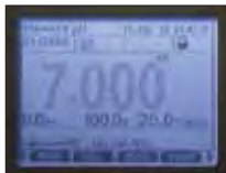
Unstable reading is faded.