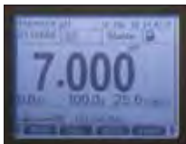
Reading turns solid when stable.